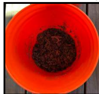
Compost + Algae