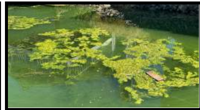
Algae Blooms in the California Delta