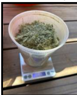
Weighing Dried Algae