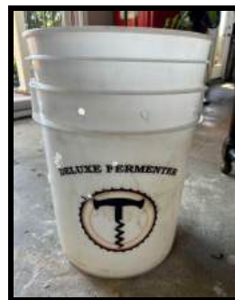
Drilling Compost Bucket