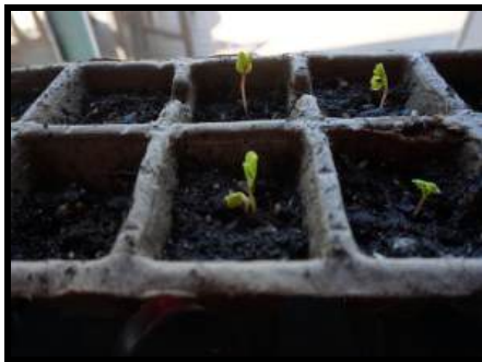
Beta Testing Radishes